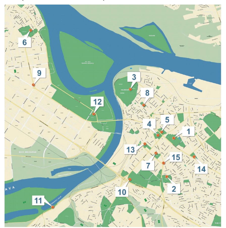
Fig. 1. The study area and sampling locations. Legend: 1. Tašmajdan, 2. Karađorđev park, 3. Kalemegdan, 4. Pionirski park, 5. Skupština, 6. Zemun, 7. Manjež, 8. Studentski park, 9. Novi Beograd, 10. Mostarska petlja, 11. Ada Ciganlija, 12. Ušće, 13. Finansijski park, 14. Vukov spomenik, 15. Slavija.

presented with 2 or 3 samples, one sample from the children's playground and one or two samples near a street or crossroad. At each sampling point, three sub-samples, from top 10 cm layer, within a 20 cm×20 cm surface, were taken and mixed to obtain a bulk composite sample. Such a sampling strategy was adopted in order to reduce the possibility of random influence of urban waste not clearly visible.<sup>5</sup> Samples were collected with a stainless trowel and transferred to the laboratory in plastic bags. Stones and foreign objects were hand-removed, and the samples were air-dried for seven days.