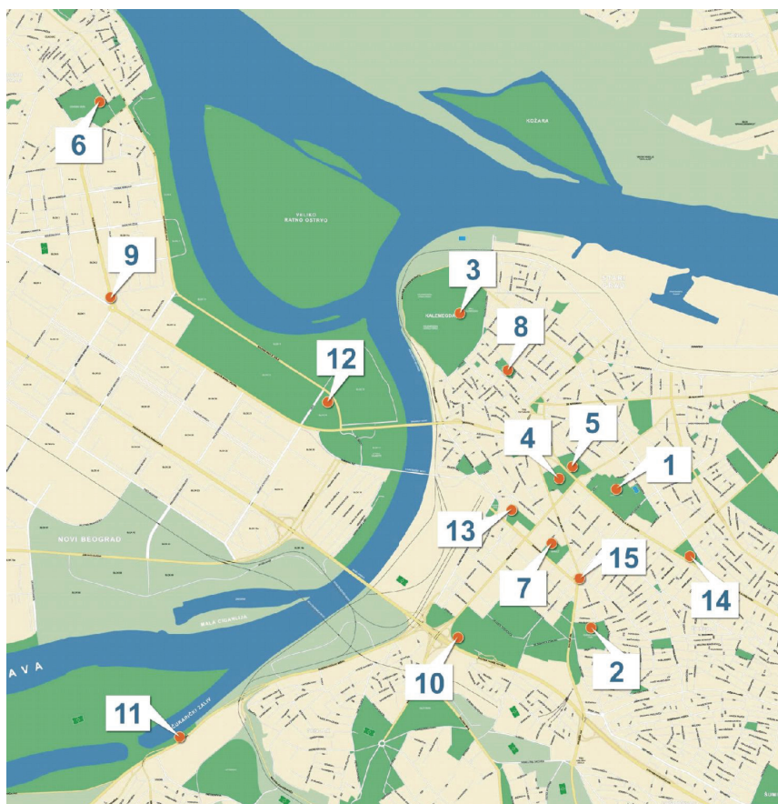
Fig. 1. The study area and sampling locations. Legend: 1. Tašmajdan, 2. Karadorđev park, 3. Kalemegdan, 4. Pionirski park, 5. Skupština, 6. Zemun, 7. Manjež, 8. Studentski park, 9. Novi Beograd, 10. Mostarska petlja, 11. Ada Ciganlija, 12. Ušće, 13. Finansijski park, 14. Vukov spomenik, 15. Slavija.

presented with 2 or 3 samples, one sample from the children's playground and one or two samples near a street or crossroad. At each sampling point, three sub-samples, from top 10 cm layer, within a 20 cm×20 cm surface, were taken and mixed to obtain a bulk composite sample. Such a sampling strategy was adopted in order to reduce the possibility of random influence of urban waste not clearly visible. 5 Samples were collected with a stainless trowel and transferred to the laboratory in plastic bags. Stones and foreign objects were hand-removed, and the samples were air-dried for seven days.